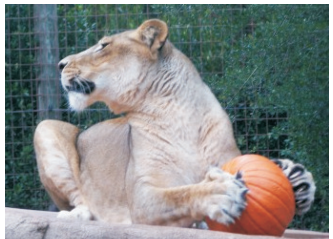
Even the lions received pumpkins for Halloween!

Equally as important are the volunteers that included UPS, Hands On Greenville, Washington & Lee Alumni, Carolina High School, Brashier Middle College Charter High Beta Club, Greenville Tech - International Group, and of course, our own Greenville Zoo volunteers. Many thanks to each of you!