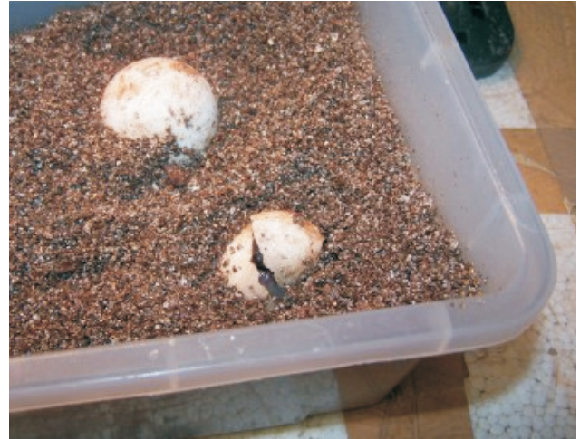
Look closely to see one of the eggs hatching.

Alligator snapping turtles are the largest freshwater turtle in the world and occur in 14 states within the Mississippi River drainage.